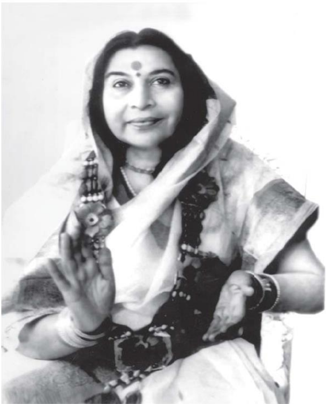
Her Holiness Shri Mataji Nirmala Devi Founder of Sahaja Yoga